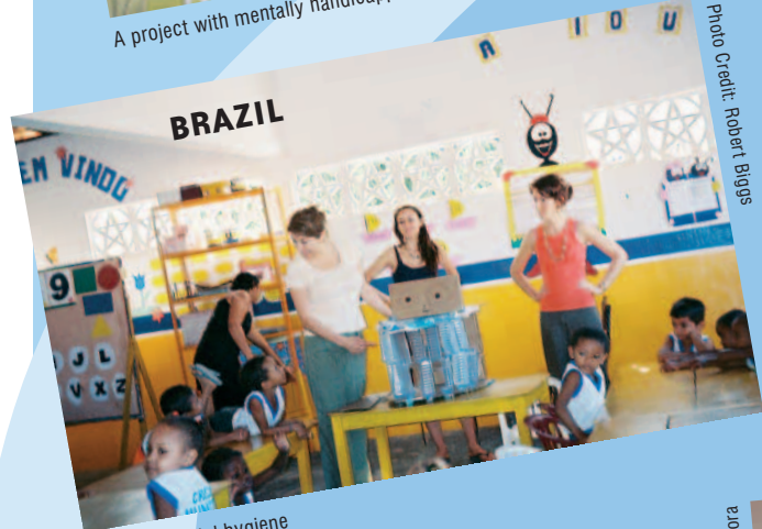
A project with mentally handicapped children